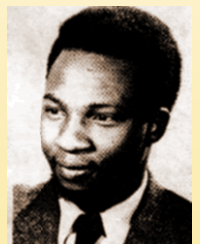
(Pictured above Joseph Conrad and Camara Laye)